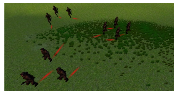
(c) Sub-groups moving to different destinations

Fig. 3. The deploy script running on 10 agents.