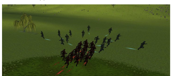
(b) Blue team notices incoming Red team