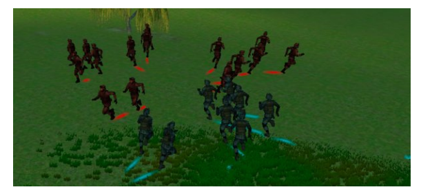
(b) Blue team members break off to chase Red team.

(a) Blue team on patrol - looking for Red team.