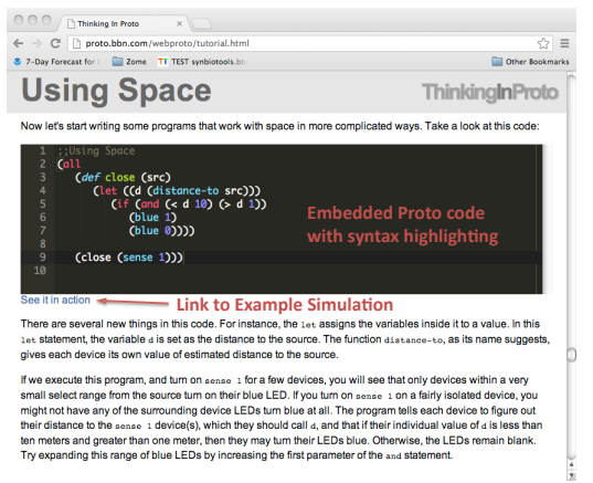
Fig. 2. Part of the "Thinking in Proto" web tutorial, showing embedded Proto code with automatic syntax highlighting and a link that opens a new page with an example WebProto simulation using that code.

and then one by one introduces key concepts of Proto and its continuous space/time approach to aggregate programming.